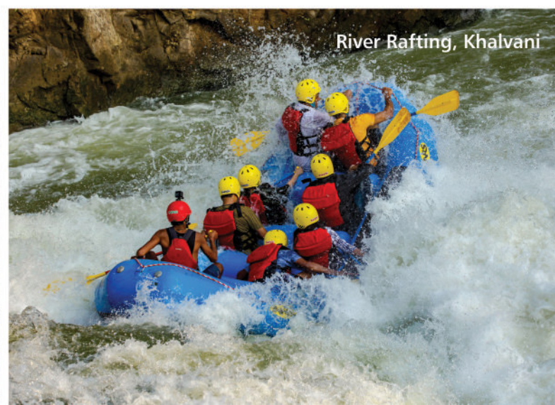
River Rafting, Khalvani