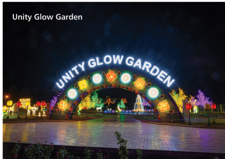
Unity Glow Garden