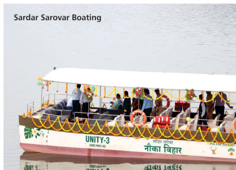
Sardar Sarovar Boating