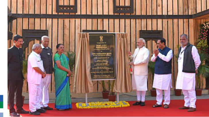
Inauguration of Tent City Narmada by Shri Narendra Modi, Hon'ble Prime Minister of India