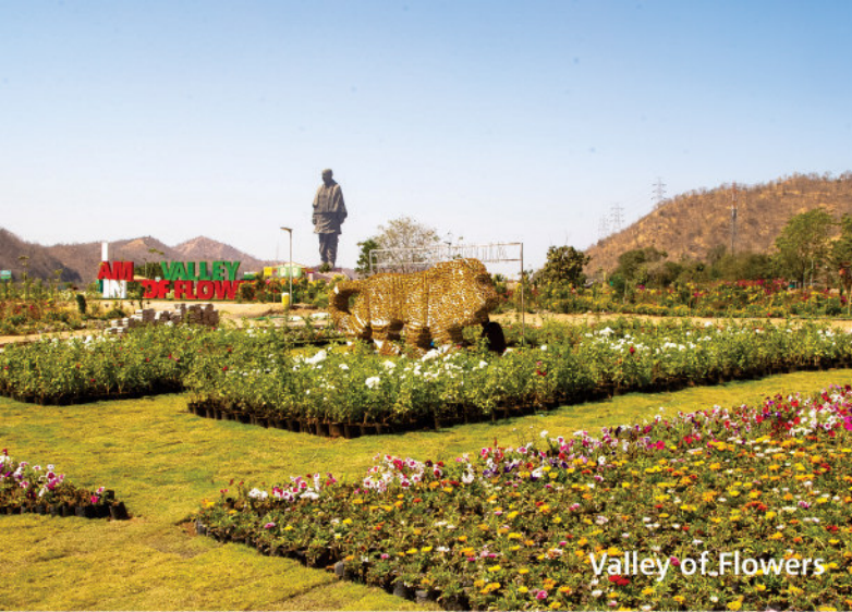
Valley of Flowers