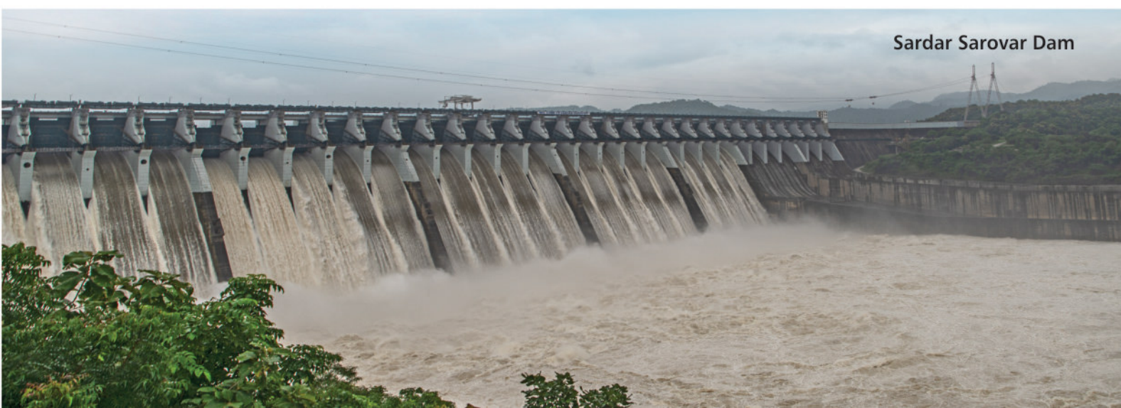
Sardar Sarovar Dam