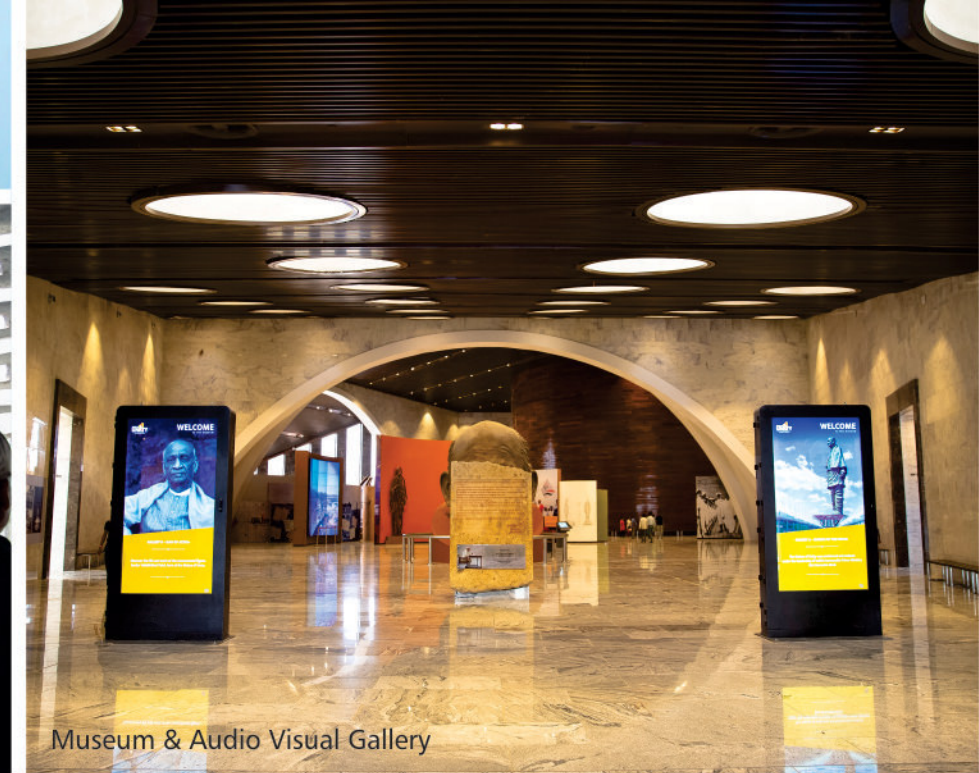
Museum & Audio Visual Gallery