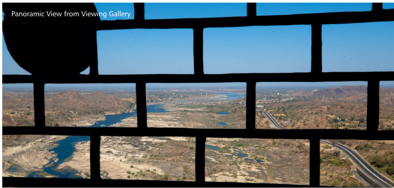
Panoramic View from Viewing Gallery